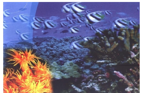
Photo Credit: J Watts, from "The Living Reef" produced by the Nature Conservancy of Hawai'i and Hawai'i State Department of Land and Natural Resources